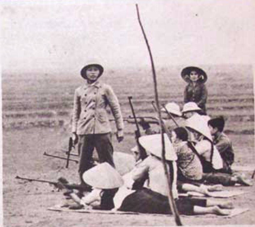
"The fortitude and political/military brilliance of the liberation forces is almost impossible for the Americans to understand."

But for all its effectiveness at "search and destroy," neither the U.S. army nor its Saigon clients have been able to achieve the necessary corollary of pacification. Without pacification their initially superior power is doomed to weakness. When concentrated, they are forced back into enclaves, and the countryside is opened to the people and the guerrillas. When dispersed, their technically superior force loses its striking power through over-extension into too many forays and is in grave