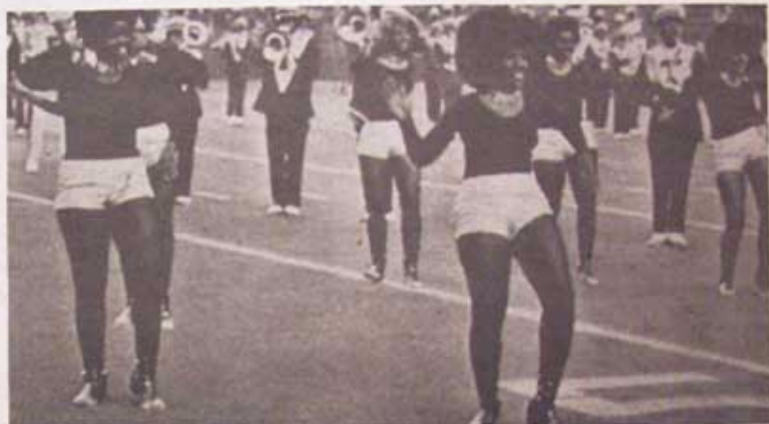
"What happened to the Black campus revolution? What happened to the gun-toting nationalist, the uncombed hair, the demonstrations and the Malcolm X 'T' shirts?"

"Our direction for the past quarter and the quarter to come is toward meeting the educational, social, political and service needs of black students in relation to self-help and coordination. Our programs and projects are designed primarily to service the black family at UCLA in the most constructive and productive ways we can. The Black Student Union programs are: Sickle Cell