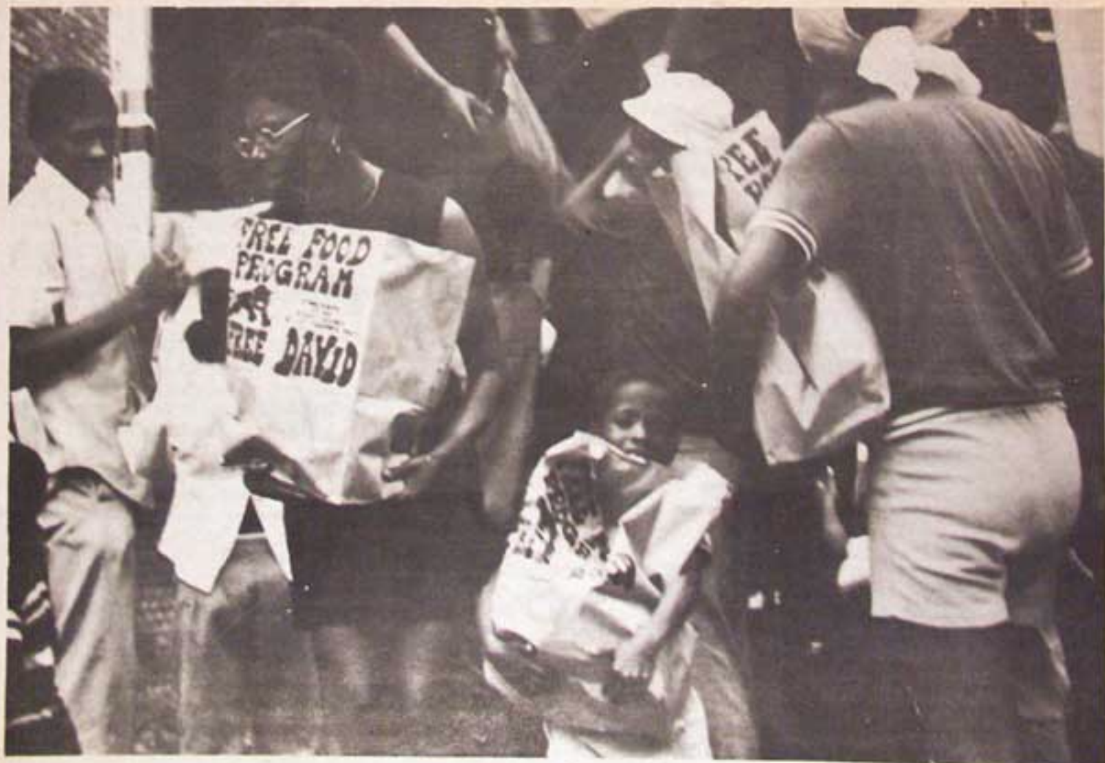
The theme of the Survival Day Rally in Detroit was the immediate release of Comrade DAVID HILLIARD, CHIEF OF STAFF OF THE BLACK PANTHER PARTY.